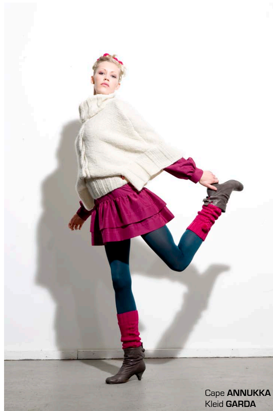
Cape ANNUKKA Kleid GARDA