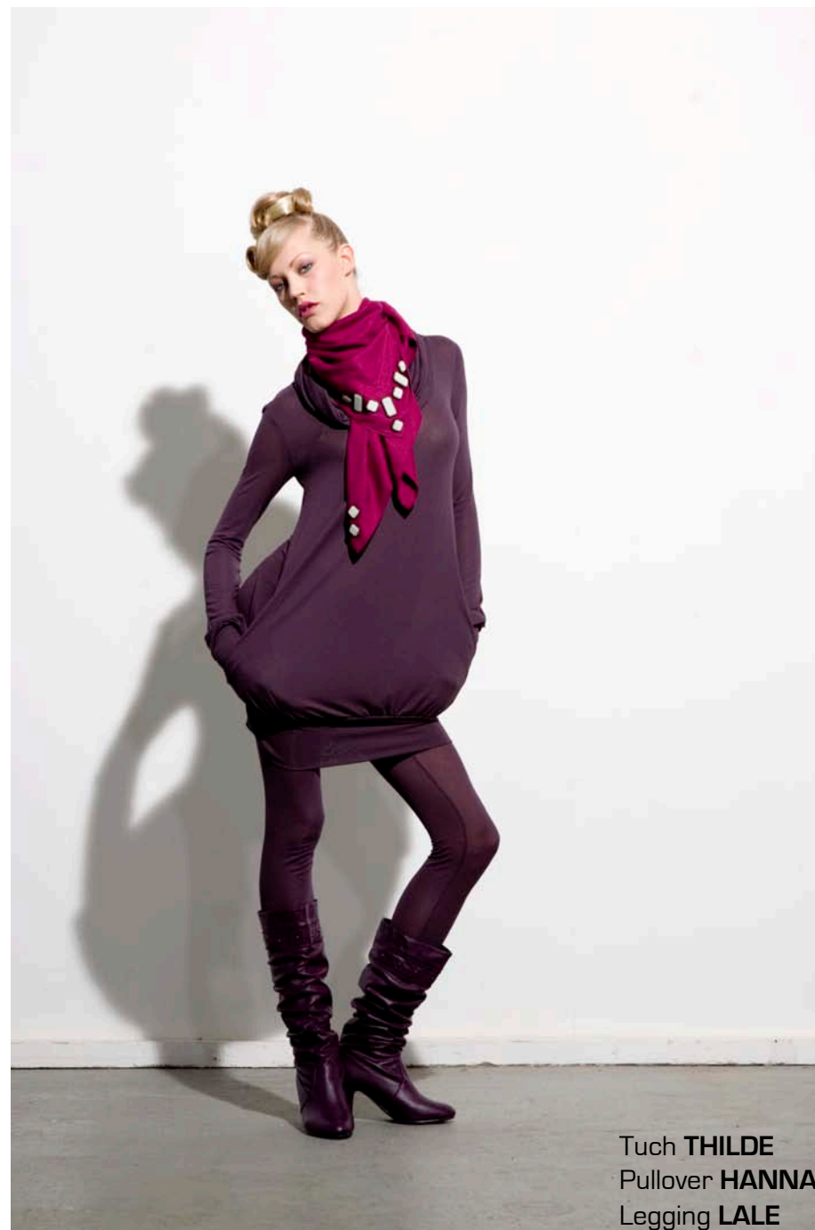
Tuch THILDE Pullover HANNA Legging LALE