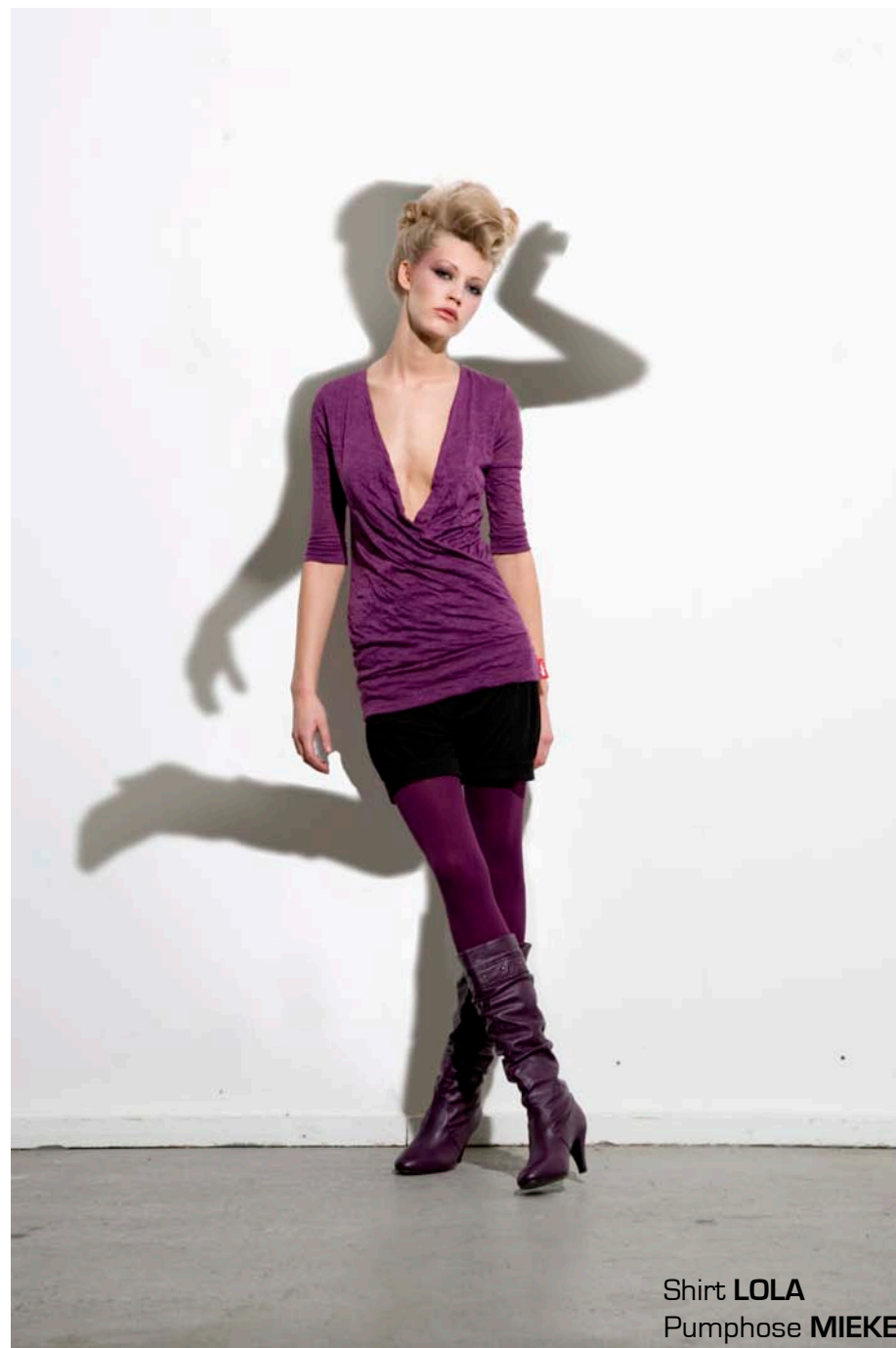
Shirt LOLA Pumphose MIEKE