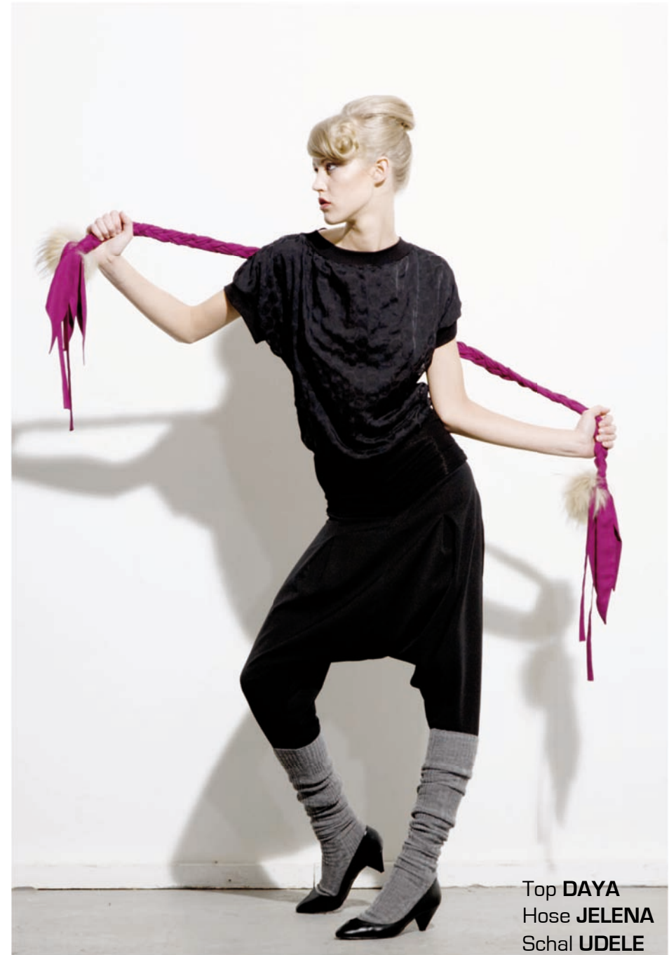
Top DAYA Hose JELENA Schal UDELE