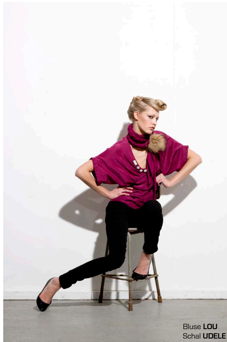
Bluse LOU Schal UDELE