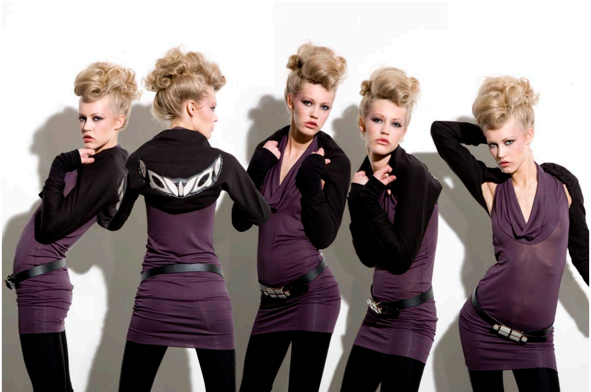
Top HELMA Shrug ALEA