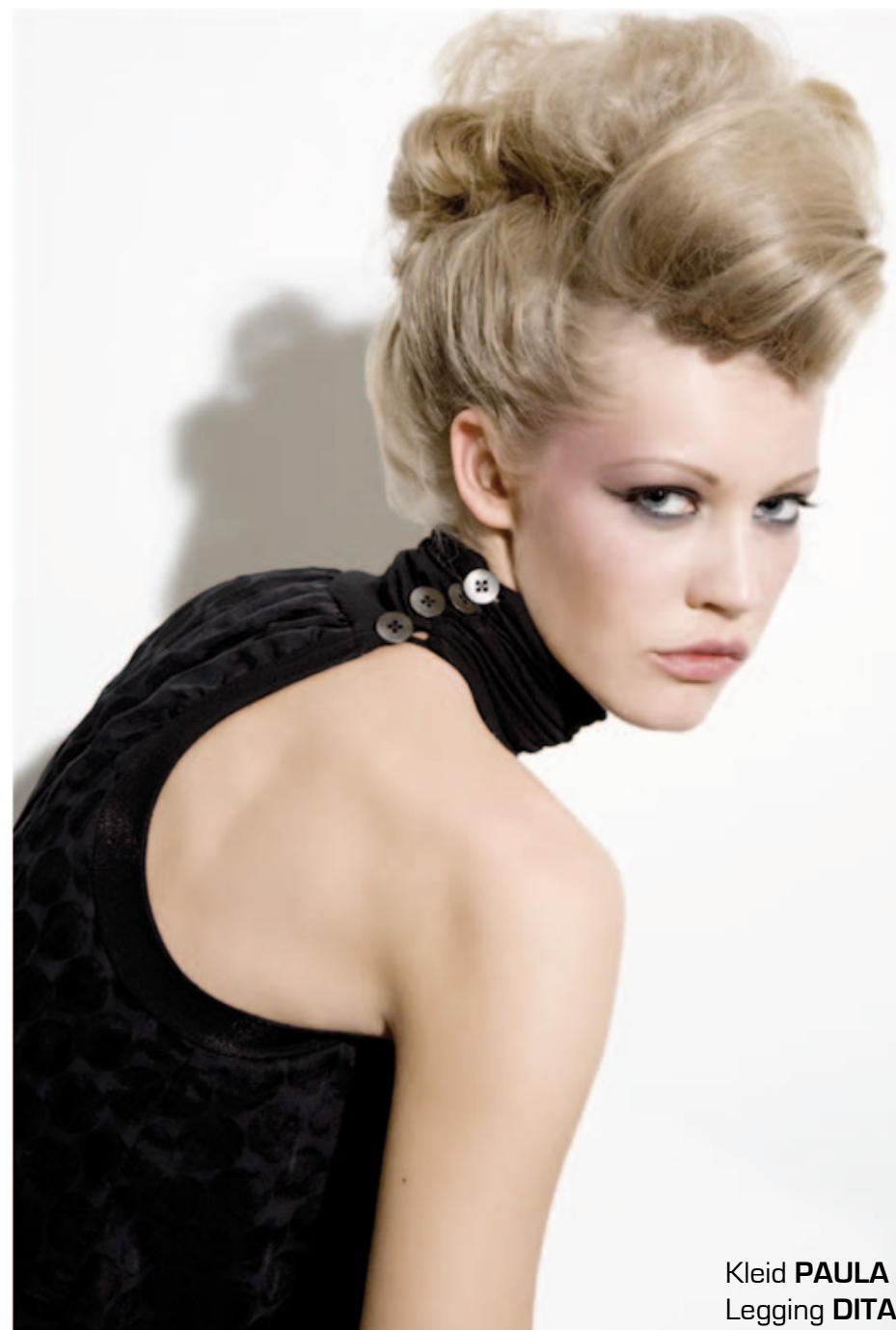
Kleid PAULA Legging DITA