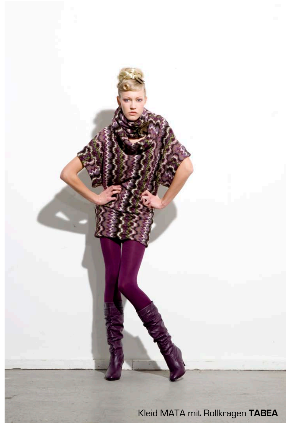
Kleid MATA mit Rollkragen TABEA