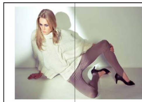
Pullover ANNUKKA AW1011-081 col.060 Stegleggings LUANA AW1011-093 col.130