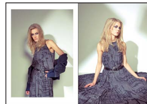
Kleid MARTJE AW1011-087 col.830 Jacke SALMA AW1011-101 col.392