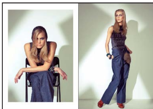
Rollkragentop EMINA AW1011-085 col.830 Jeans SIDONIE AW1011-099 col.392