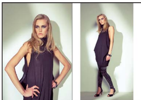
Longtop AIMEE AW1011-090 col.900 Stegleggings MAILIN AW1011-092 col.830