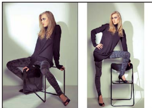
Longpullover DORLE AW1011-089 col.900 Stegleggings MAILIN AW1011-092 col.830