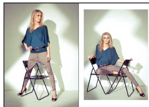
Top MARIT FS1011-081 col.482 Hose THYRA AW1011-095 col.130