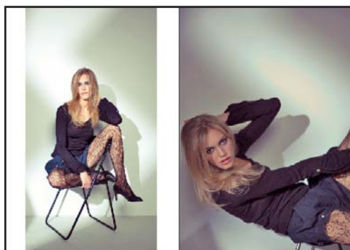
Pullover TALISA AW1011-080 col.900 Jeansshorts SILJA AW1011-100 col.392