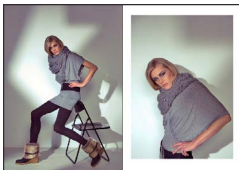
Longtop GRACE FS1011-049 col.820 Leggings ANNETTA oder schwarz col.900 Schalkragen FLEUR AW1011-103 col.820