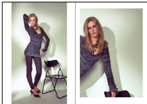
Longsleeve TARA AW1011-079 col.830 Leggings ANNETTA FS 1011-059 col.900