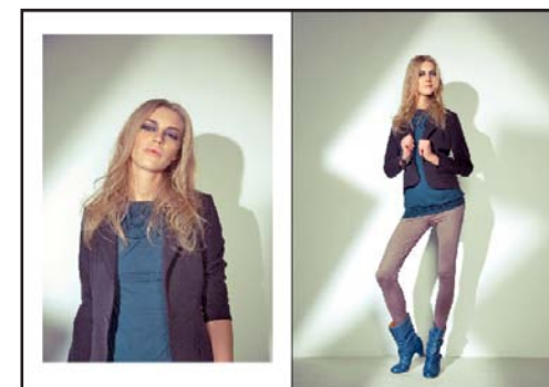
Top LUCIE FS1011-029 col.482 Blazer TEDA oder schwarz col.900 Stegleggings LUANA AW1011-093 col.130