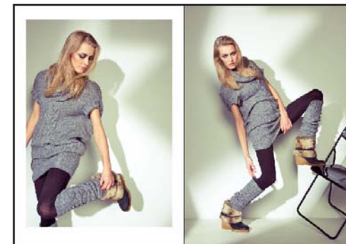
Strickpullover RAHEL AW1011-079 col.820 Leggings ANNETTA FS1011-059 col.900 Stulpen CALLA AW1011-102 col.820